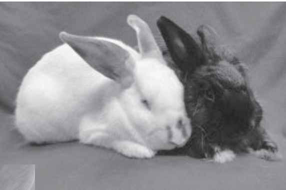
Awesome and Gorgeous.

pounds, with a long body, slightly fluffy fur, and a dark silver and light cream color. He's a Magpie Harlequin blend. Have you