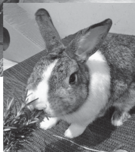
Sage (aka Peter) is an amazingly sweet and funny bunny...a healthy, happy boy!